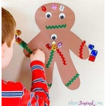
Large wall collage